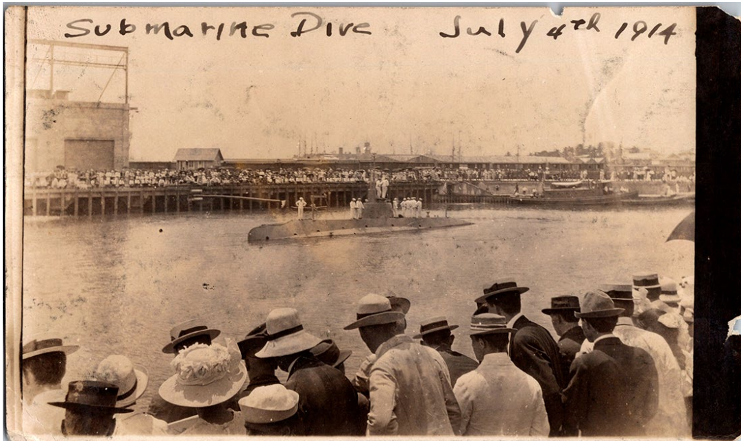
Example of a real photo postcard with the handwritten caption "Submarine Dive, July 4th, 1914."