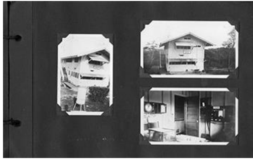
A page from one of the Malsbury Family photo albums with photos depicting the exterior and interior of the Madden Dam Hydrographic Office, one of the locations where Charles Malsbury worked.