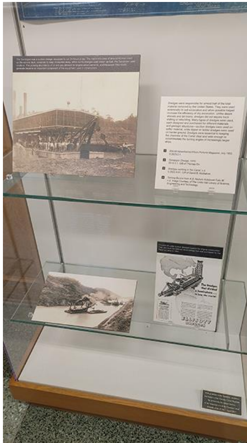
This case highlights the dredges that were so crucial to the digging of the Canal, including the Sandpiper suction dredge, which was equipped to run 24 hours a day with the crew living onboard.